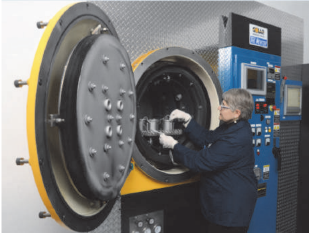
Fig. 5 — AM-capable vacuum furnaces range from lab size to 48 ft long.