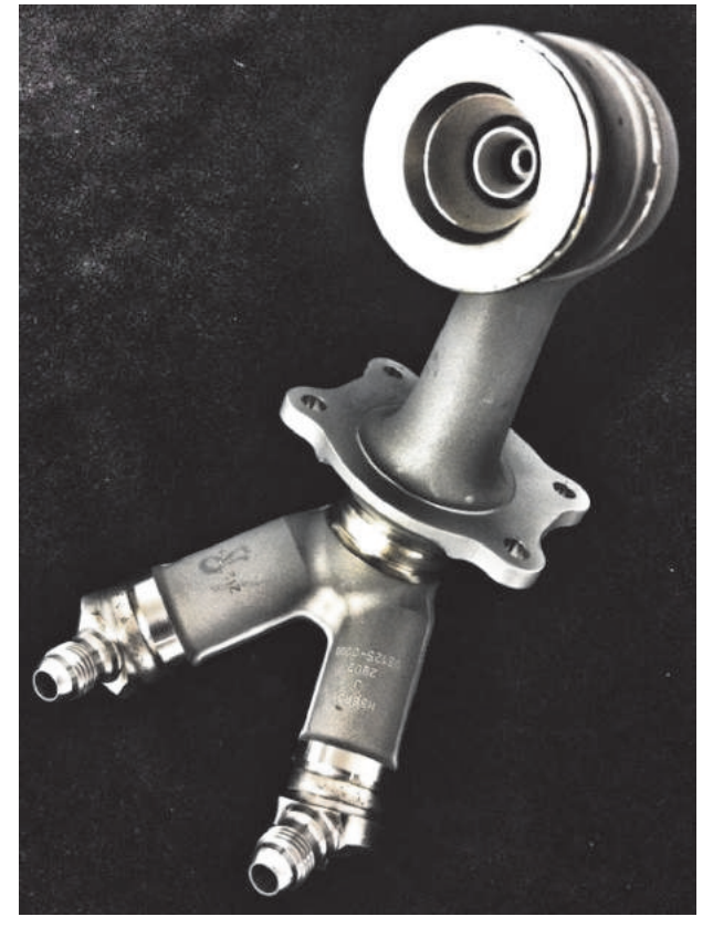
Fig. 1 — DMLS one-piece fuel nozzle is the first FAA-cleared 3D printed part to fly in a commercial jet.

Therefore, the big challenge facing the AM industry is to identify new, effective quality assurance techniques. In most cases, certification and validation initiatives for AM products are being driven by primary contractors such as General Electric Aviation and Lockheed Martin. GE has spent millions of dollars on mass inking and qualifying a very intricate fuel nozzle (Fig. 1) made using direct metal laser sintering for use on next-generation LEAP (leading edge aviation propulsion) high-bypass turbofan engines. The one-piece printed fuel