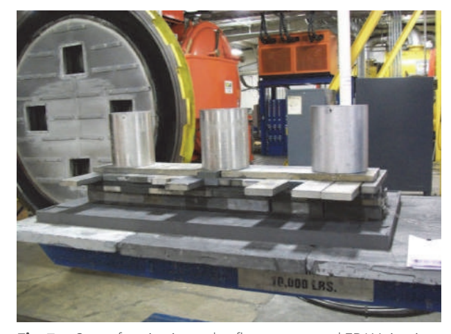
Fig. 7 — Creep-forming is used to flatten a warped EBAM titanium baseplate by placing weights on the part during heat treatment.

For more information: Robert Hill is President, Solar Atmospheres of Western PA, 30 Industrial Rd., Hermitage, PA 16148, 724.982.0660, ext. 2224, bobh@solarwpa.com, www. solaratm.com.