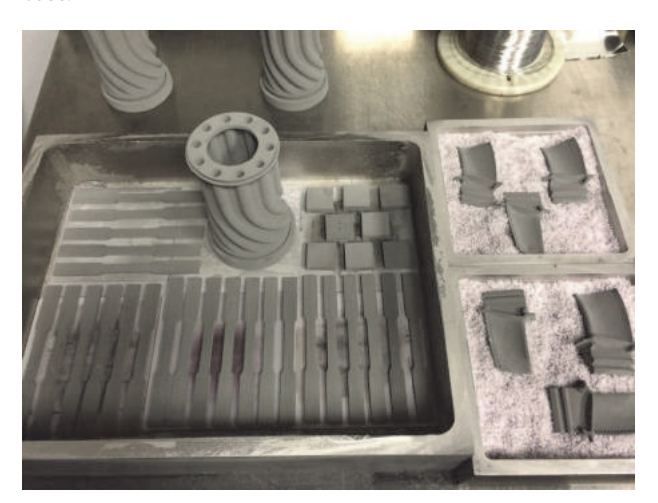
Fig. 4 — BJP-printed engine blades and other titanium alloy test pieces.

crucial piece of equipment in the additive manufacturing industry is a well-maintained vacuum furnace, which operates totally devoid of oxygen, is equipped with diffusion pumps to achieve deep vacuum levels, and has very precise temperature control (Fig. 5).