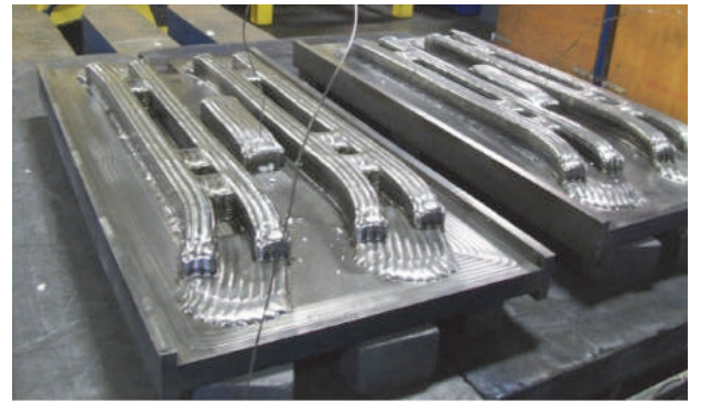
Fig. 3 — EBAM is used to deposit titanium wire on a titanium base.

AM is rapidly developing due to the demand for nearnet shape parts with geometries that are impossible to machine. Because AM parts require very little material removal during downstream processing, it is imperative that finished parts do not have any decarburization or contaminated surfaces from subsequent thermal processing. Therefore, a