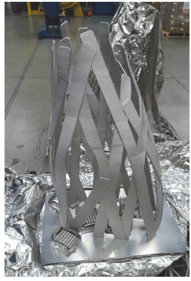
Fig. 2 — Decorative part for the yacht "Hollow Ribbons" made using DMLS.

of similar material within a vacuum chamber. The process deposits material at a higher rate than DMLS, but the finished shape is not as fine. Material for EBAM parts that are vacuum heat treated is predominantly Ti-6Al-4V (Fig. 3).