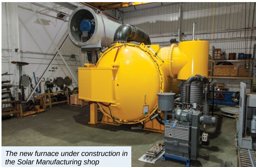
The new furnace under construction in the Solar Manufacturing shop